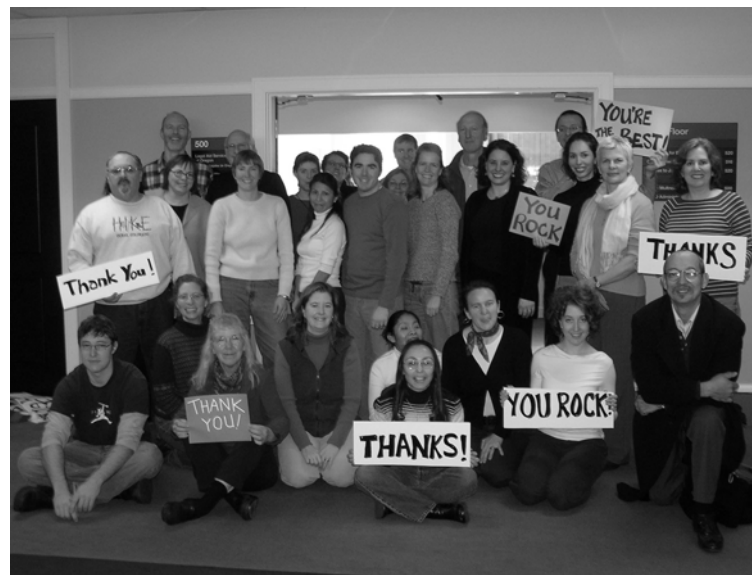
Staff members of the Legal Aid Services of Oregon